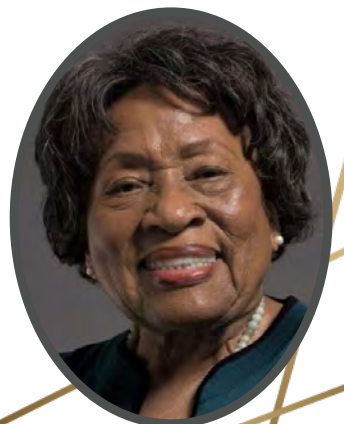
DR. JOCELYN ELDERS Retired Educator, Former U.S. Surgeon General